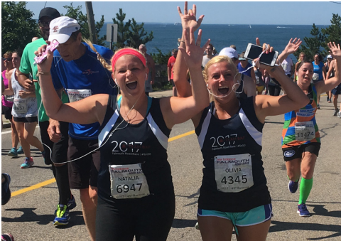
Falmouth Road Race for Brain Aneurysm Awareness