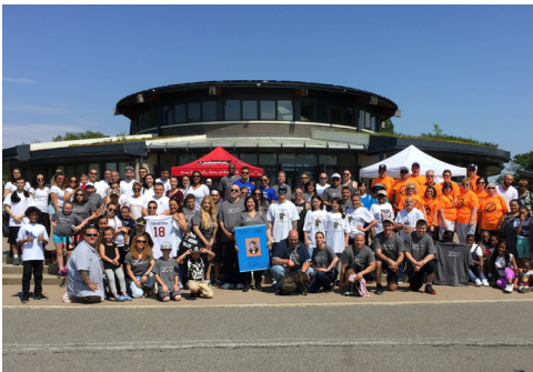
5th Annual Brooklyn Walk for Brain Aneurysm Awareness