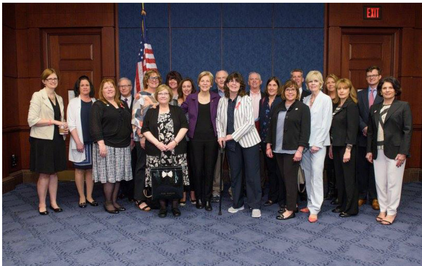
U.S. Senator Elizabeth Warren with brain aneurysm advocates on Capitol Hill.

The foundation thanks everyone who participated, with a special nod to its pro bono government affairs counsel Arnold & Porter for helping make Advocacy Day a success.