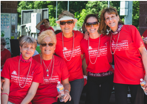
1st Annual Bergen County Battles Brain Aneurysms Walk